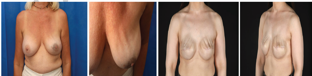
Fig. 1: Demonstrating the grading of rippling. Grade 3: Moderate degree of rippling seen at both rest and exercise. Grade 4: Persistent rippling causing gross deformity. Bra can cause impressions on the breast as seen in this patient.